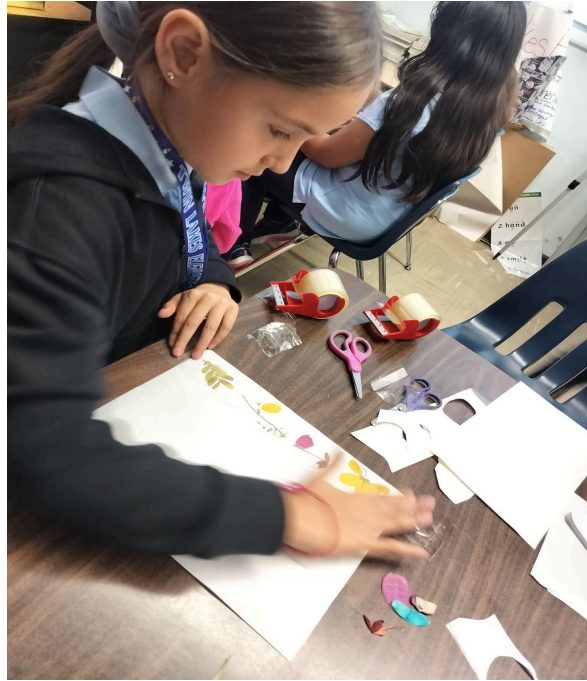
By: Alena Sheriff

Twin Lakes Elementary School 1458 w 5th Place Hialeah , FL. 33012 asheriff@dadeschools.net school code: 5601